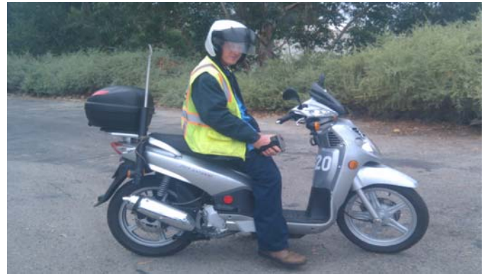
Employees will be riding a scooter similar to this or smaller mopeds. Units are registered to Alexander Contract Services or Beach City Mopeds