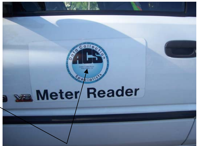
Example of Alexander Logo on our white trucks