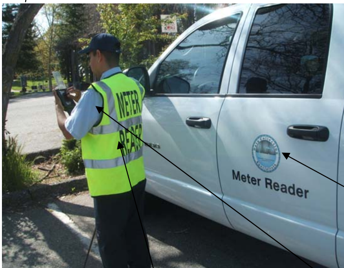
The employees will have a reflective vest that says METER READER over a blue uniform